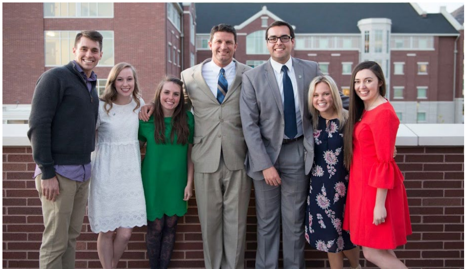
The outgoing (left) and incoming (right) Service Council residencies have gained much from their leadership opportunities