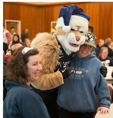
Cosmo visits Best Buddies at their Christmas event.

While we know the service being rendered makes a difference to the one being served, it is inspiring to hear that the students are also finding the experience uplifting.