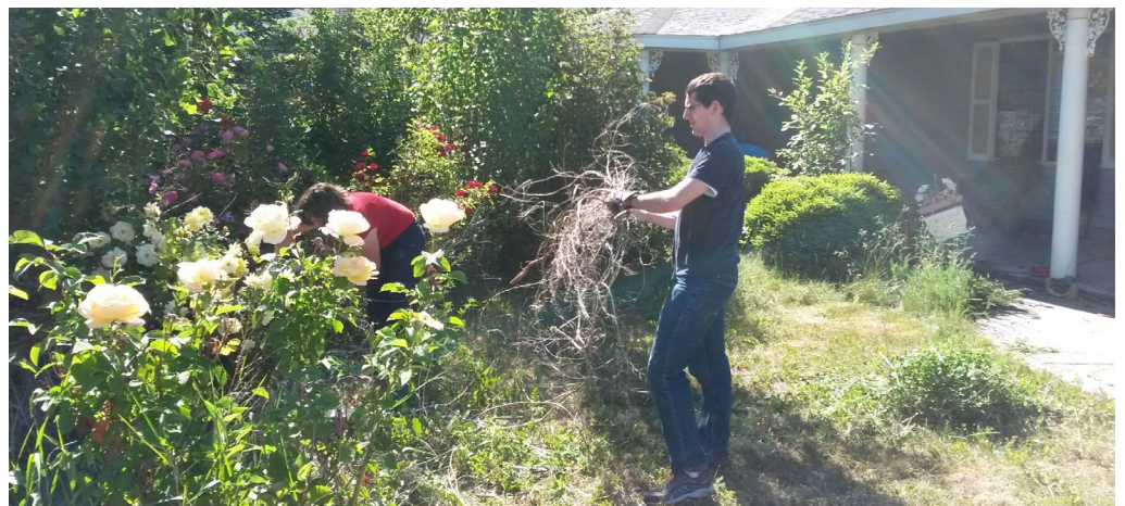
Bottom: A volunteer from the Response program assists in cleaning the yard of a local Provo resident.