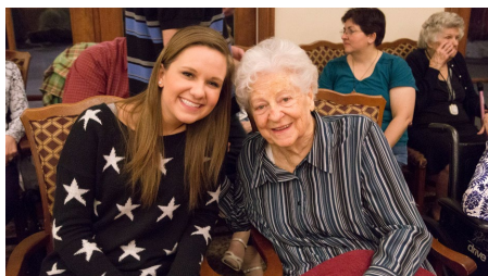
Volunteers at Adopt a Grandparent make connections with residents of assisted living and retirement homes

Students get involved for many reasons. Some students get involved because of a class requirement, and find they enjoy serving so much they want to continue.